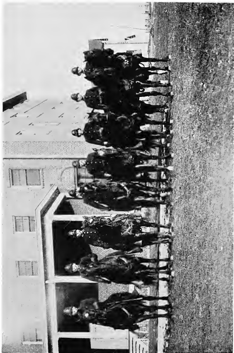
AT "A" TROOP BARRACKS